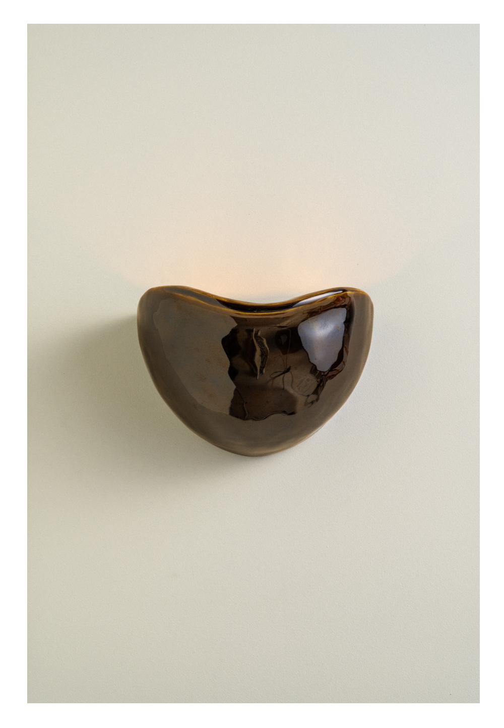
Simone No. 1 Amber TECHNICAL SPECIFICATIONS